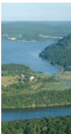
Bend in the Hudson River from Bike Route 9