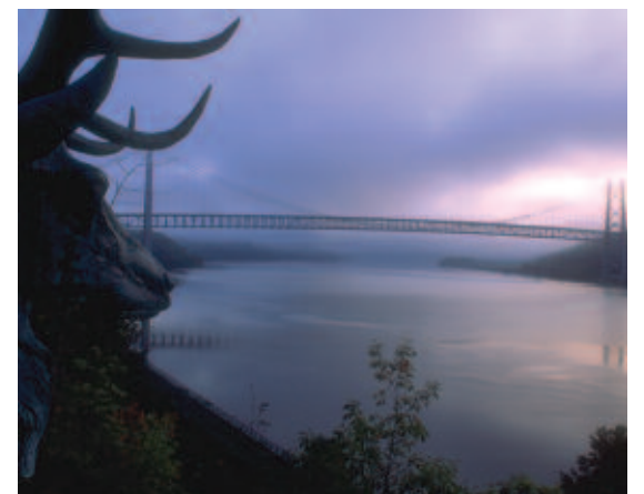
View of the Bear Mountain Bridge from the Palisades